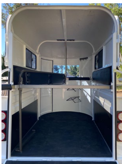
ONE PIECE RUMP BAR