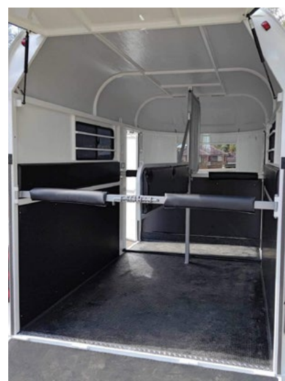
NO REAR DOG LEG