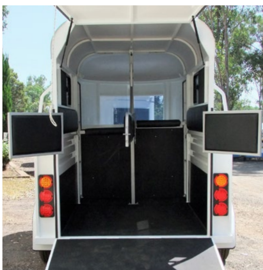
PADDED DIVIDERS AND BREACHING GATES