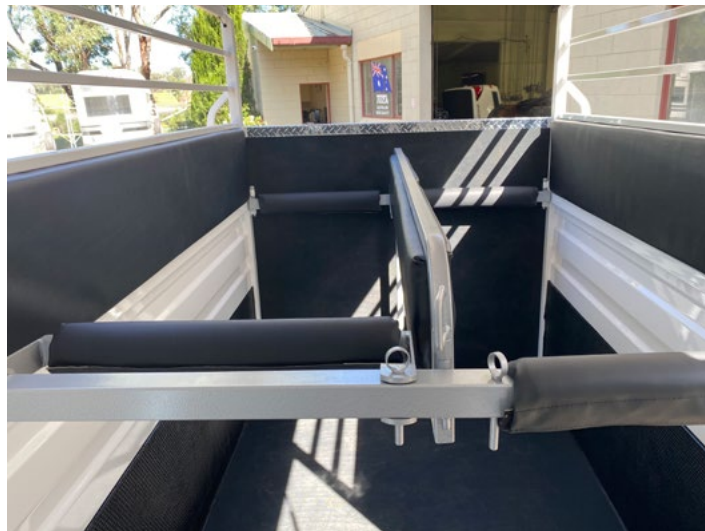
ADJUSTABLE CHEST BAR