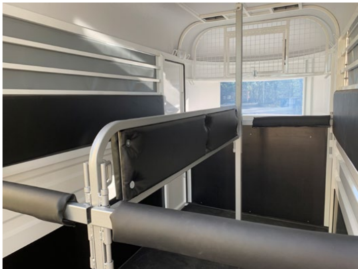
PADDED CHEST BARS, RUMP BARS AND CENTRE DIVIDER