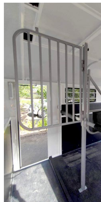
BAR HEAD DIVIDER