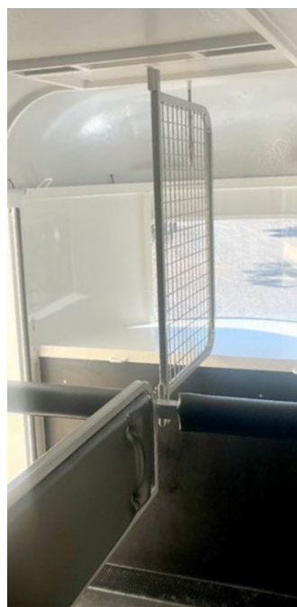
MESH HEAD DIVIDER